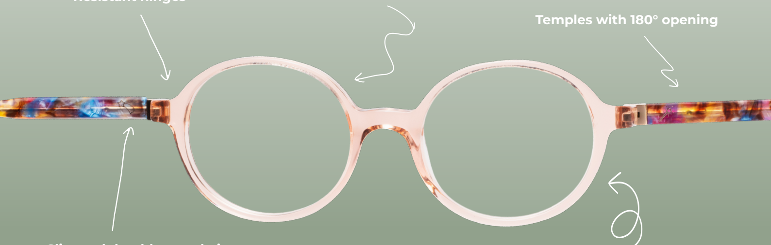
Full cut from acetate sheets